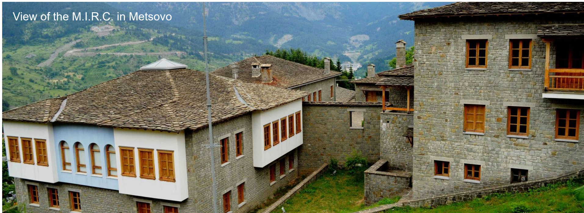
View of the M.I.R.C. in Metsovo